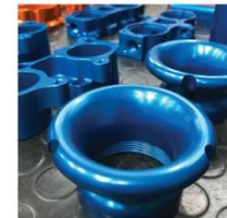
Blue 2 Light Blue