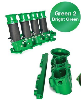
Green 2 Bright Green