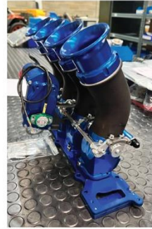
Blue 3 Blue